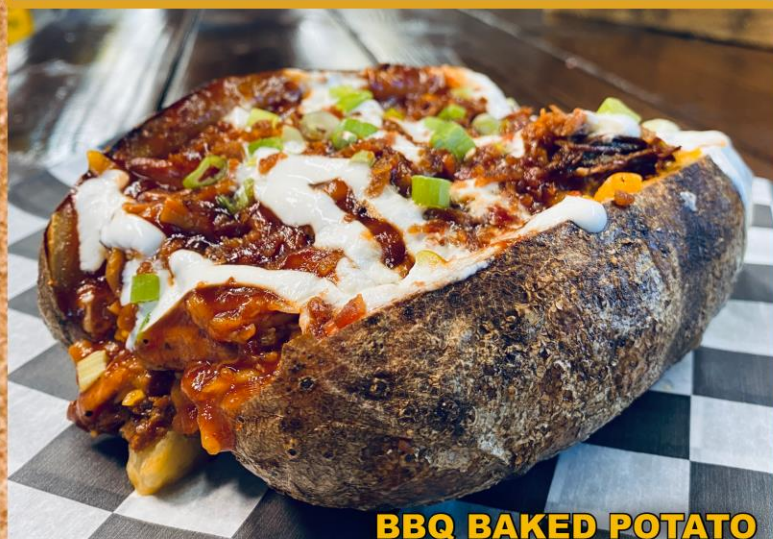
BBQ BAKED POTATO

Baked Potato topped with chopped bacon, shredded cheddar cheese, green onions and sour cream $7.54