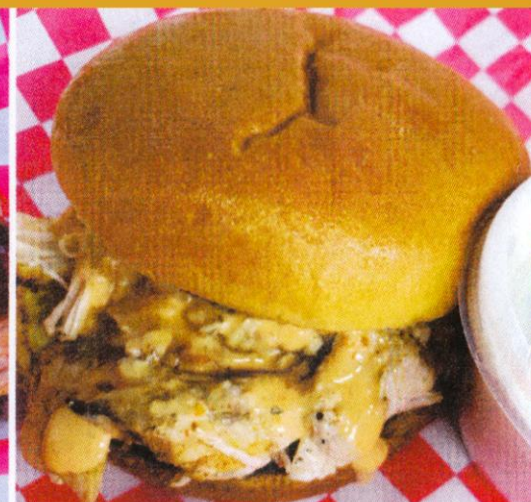
GRILLED CHICKEN SANDWICH