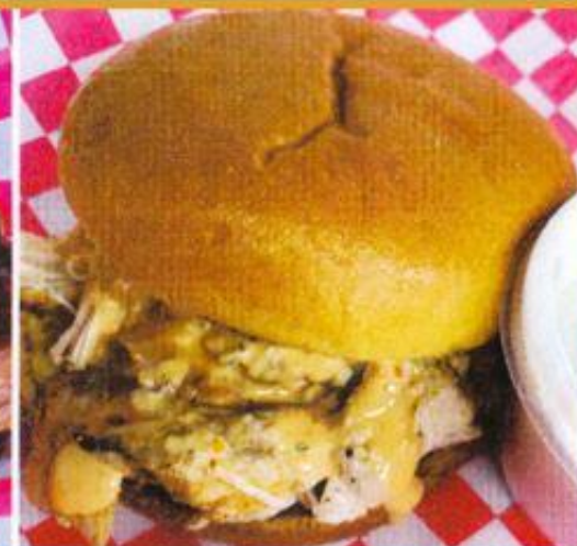
GRILLED CHICKEN SANDWICH