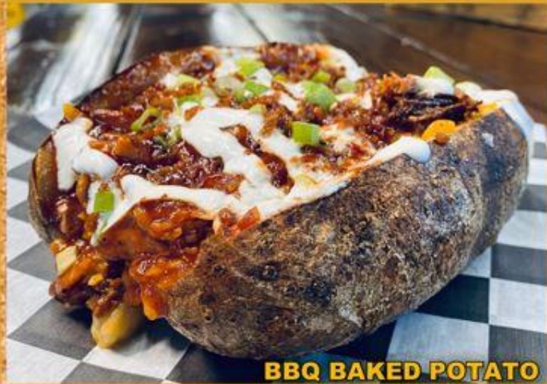
BBQ BAKED POTATO

Baked Potato topped with chopped bacon, shredded cheddar cheese, green onions and sour cream $7.54