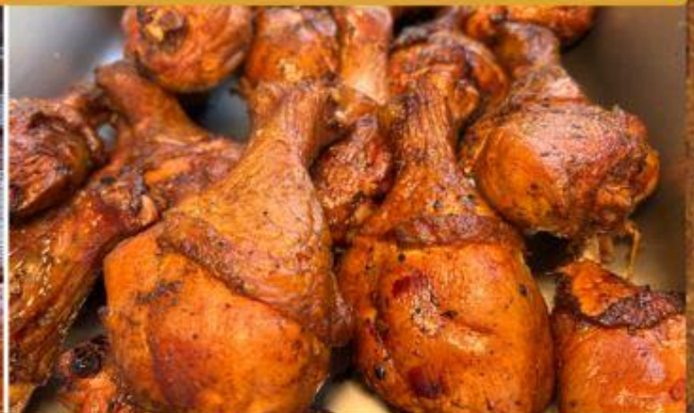
SMOKED CHICKEN DRUMSTICKS